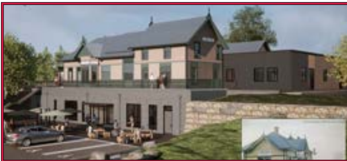
Artist rendering of completed project