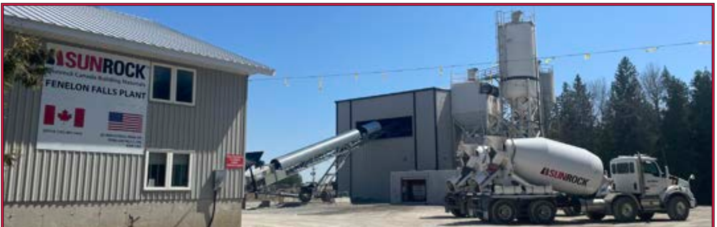
Fenelon Falls Ready Mix Facility in Ontario, Canada

As we continue to meet the growing demands in the region, we remain committed to sustainability and delivering top-quality concrete products to our valued customers in a safe and efficient manner. Our investments in technology and infrastructure ensure that we are well-equipped to contribute to Canada's ongoing development and growth.