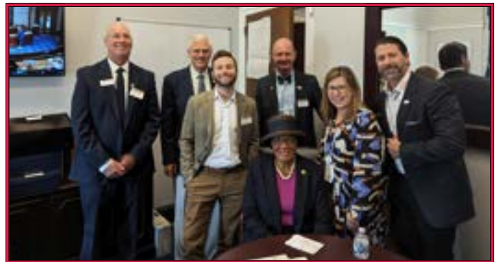
NCAA Reps meeting with Rep. Alma Adams