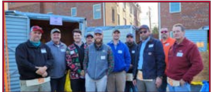
Sunrock's Contracting Team at DRM Toy Giveaway

We are truly blessed to have such great organizations like the Durham Rescue Mission operate in our community and help those in need, especially during the holiday season. Events such as these where we are able to give back to the community is what Christmas is all about. Thank you to the DRM for hosting this event and we look forward to helping again in the future!