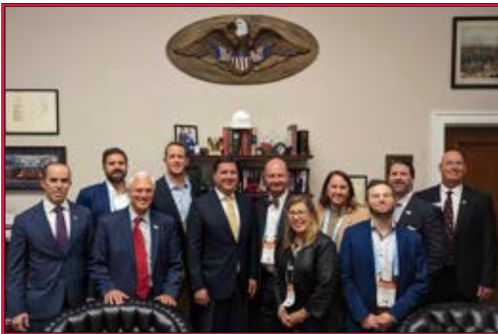
NCAA Reps meeting with Rep. David Rouzer