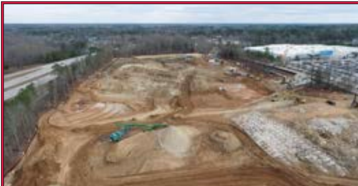
Aerial view of Town Triangle early stages