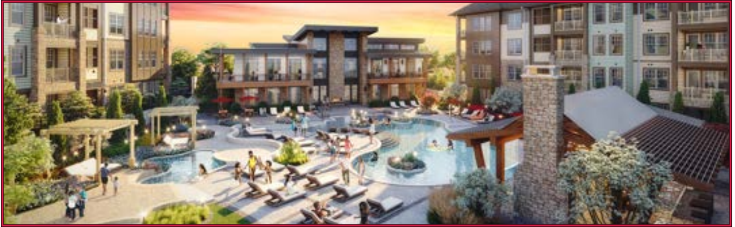
Artist rendering of completed project

Sunrock has been proud to work with New South Construction on the Town Triangle Crossing Project in Raleigh. Construction on this large-scale, multi-family project began back in October of 2022. Town Triangle Crossing is situated on 24 acres and will house 384 units, including 187 one-bedroom, 173 two-bedroom, and 24 three-bedroom apartments across a collection of 10 buildings that are four stories tall. Sunrock is completing all sitework for this project. This includes mass grading, grading for all roads and sidewalks, as well as other various grading and utility activities. We have installed approximately 4,000 linear feet (LF) of RCP storm drain, 10,000 LF of sewer line, and 5,500 LF of waterline.