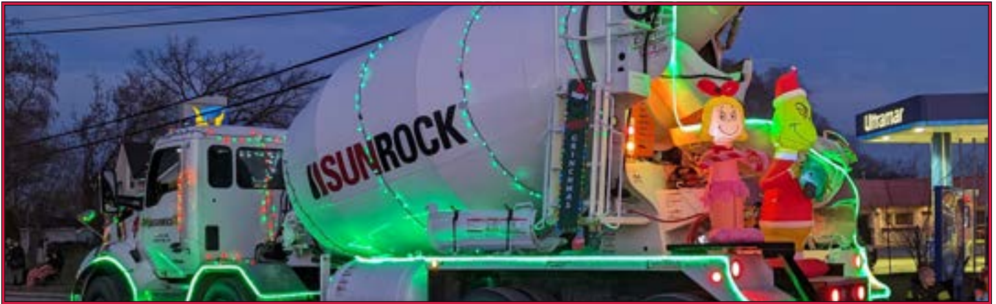
A Sunrock Canada Mixer Truck decorated for Fenelon Falls Parade

Sunrock takes pride in being an active corporate citizen within the communities where we operate in. This is achieved in part through our continued involvement in community events throughout our Canada and U.S. operations, including holiday parades. We were proud to be a part of the Uxbridge, Fenelon Falls, Butner, and Hillsborough Christmas Parades that took place throughout the tail end of last year.