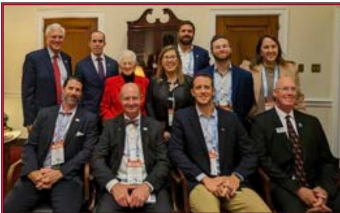
NCAA Reps meeting with Virginia Foxx