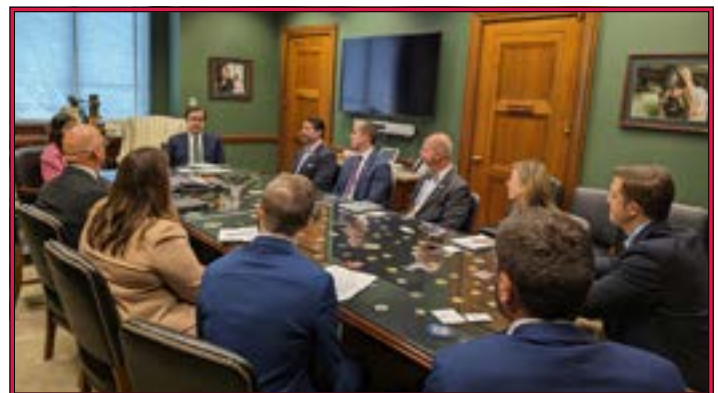
NCAA Reps meeting with Leg. Assistant to Senator Thom Tillis