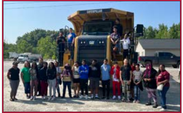
Students from VGCC tour the Kittrell Quarry