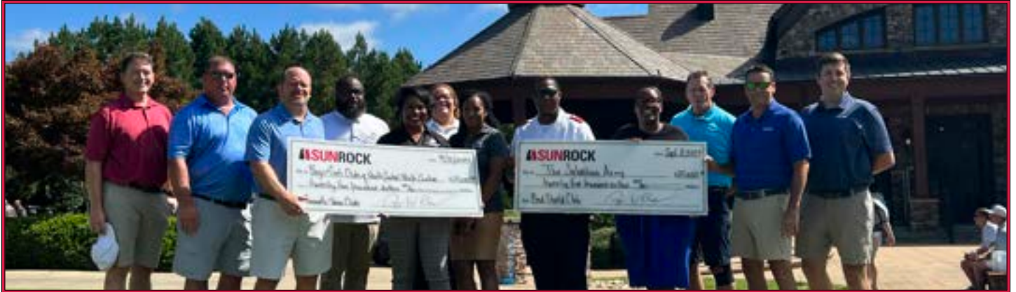
Sunrock Executive Team Members present checks to the charities involved

It couldn't have been a more beautiful day for our 4th Annual Charity Golf Tournament on September 11th, which benefited the Boys & Girls Clubs of North Central North Carolina & The Salvation Army of Henderson, NC. These two incredible organizations have done so much for our community and we were proud to present each of them with a check for $25,000! This Tournament wouldn't have been possible without the help of our amazing sponsors. Thank you to everyone who came out to support a great cause, our Presenting Sponsors Giant Cement Holdings Inc & Colony Tire Corporation and all of our other wonderful sponsors. We look forward to continuing this special tournament and hope to see everyone again next year!