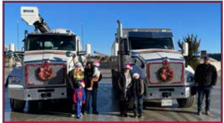
Sunrock Canada Team Members at the Uxbridge Parade