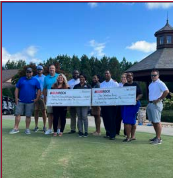
Presenting Sponsors Giant Cement & Colony Tire pose with checks