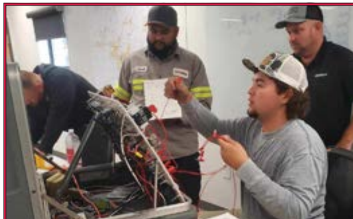
Electrical Troubleshooting Training Class provided by NFPI