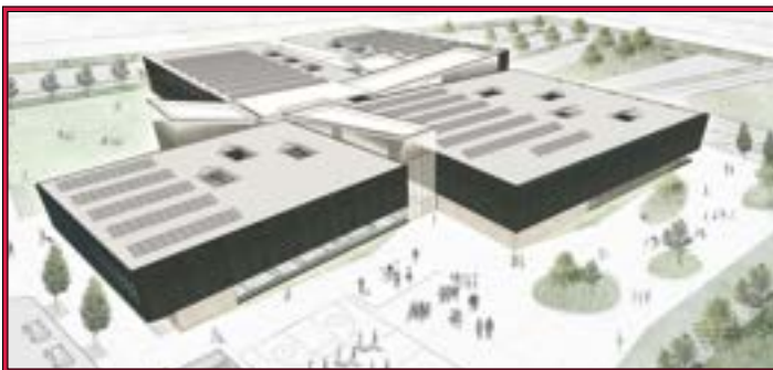
Artist rendering of Whitby Sports Complex

The Town of Whitby in Ontario, Canada is working to construct a new Sports Complex to help meet both the immediate and future recreational needs of the growing community. The vision for the complex: to create a multi-purpose gathering space for inclusive sport and community programming. Hard-co, a long time customer of Sunrock, approached us for the initial stages of this project with over 800 tonnes of material being laid for driveways and road paths. We are extremely excited to see how the next stages of this project progress and are humbled by the trust given to us by our customers.