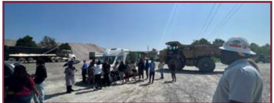
Summer Transportation Camp students at our Kittrell Quarry